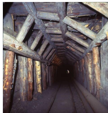
The majority of the tunnels in the mine are supported by wooden beams